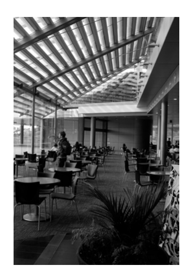
Airport, hotel or conference centre – or university?

when at Hyde Park) contained all the objects of the Empire – flora, fauna and artefacts – the Business School building encloses only the empty space of ideology: its ecosystem is an econosystem . Thus, its "massive use of glass seeks," as befits a temple to transcendental capital, "to allude to the integrity and reliability of the company that inhabits the building" (Presas 2005: 26). At once robust and transparent, the design of the Business School suggests a template not only for university architecture but also for the university per se.