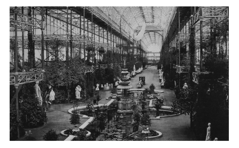
Interior of the Crystal Palace, Sydenham, c. 1854

resemblance of its "organic flowing ribbons" to the Waipapa stream that once flowed through the area down to the Auckland Harbour, and that was a site for trade between early European settlers and Ngāti Whatua, the local Māori (Saieh 2010).