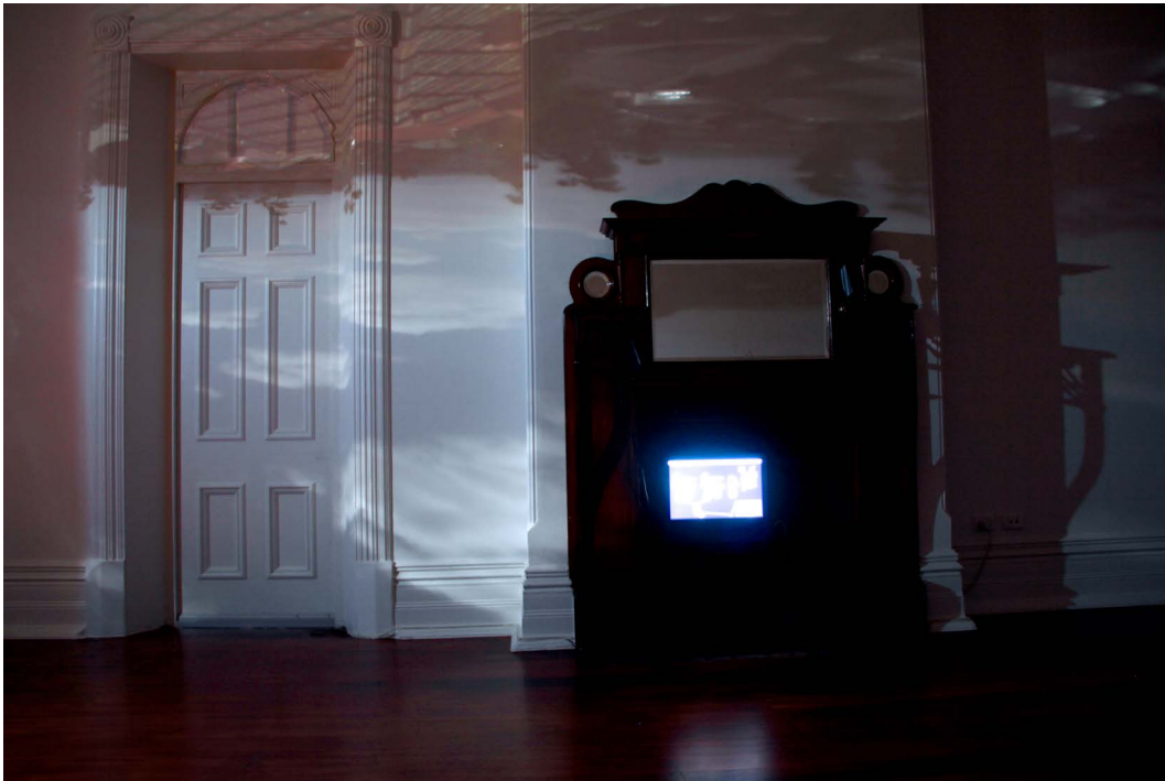
Fig. 4 Cloud Sound (2012). [Photograph of installation project]