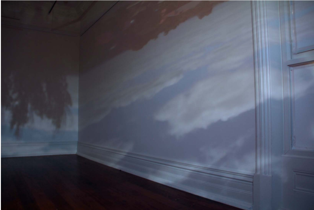
Fig. 5 Cloud Sound (2012). [Photograph of installation project]

special role in the history of architectural practice; it is the means by which the architect's activity can be imagined as intellectual, rather than mere manual, labour. Questioning this demarcation, Hill is interested in recognising in representational processes ones analogous to building – for example, reciprocal actions like “building the drawing” and “drawing the building” (Hill 2006: 57). These processes acknowledge that neither the act of drawing or building is discrete and distinct from the other. Instead, turbulent inter-relationships exist between these activities. In a similar way, I have attempted to think of the camera obscura of Cloud Sound as simultaneously drawing and building space through its combining of projected light and inhabitation.