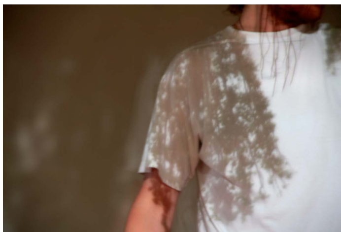
Fig. 3 Cloud Sound (2012). [Detail of camera obscura image focussed across body.]

What the architectural envelope achieves then is more than just a filtering or tempering of contingent atmospheric states; it consolidates architecture by placing climate beyond the bounds. At stake in this distinction is avoidance of turbulent limit points, and with it, threshold where things get "close to turning into something else" (Lavin 2011: 26). Cloud Sound worked against this impetus to decisively separate interior and exterior experiential fields – an impetus particularly strong with Victorian-era buildings whose architectural elements (shutters, verandahs and fenestration) and décor strategies (heavy curtaining and dark interiors) work to distance a climatic outside. This separation was amplified by the homestead's subsequent adaptation into a public art gallery, requiring even more stringent forms of climatic tempering and regulation of interior weather. Contesting this, the installation project sought to blur where interior and exterior could be imagined to reside. This blurring sought to bring the ambiguity between atmospheres as weather, and atmospheres as interior ambience, to the foreground. The conflated term 'atmosphere' describes an understanding of the interior as a dynamic, affective condition condensing various forces.