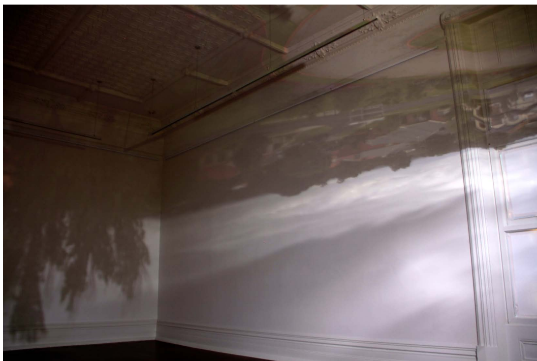
Fig. 1 Cloud Sound (2012). [Photograph of installation project, Bundoora Homestead Art Centre, Victoria, Australia, all images copyright the author]

What Jane Rendell calls “critical spatial practices” (2006: 21) have the potential to call into question habitual spatial encounters and conceptions while bringing to the fore subtle or ephemeral characteristics ordinarily overlooked. In this paper I outline a particular example of critical spatial practice – what can be thought of as an atmospheric interior. Specifically I explore what can be termed interior turbulence, a phenomenon that highlights three different registers of the atmospheric interior. Firstly, interior turbulence suggests an alternative to the typical approach to interiors, which tend to place emphasis on separation and fixed enclosures. Secondly, this term implies uncertainty, provisionality and changefulness – even a sense of turbulence within ourselves. Thirdly, interiors that are thought and experienced atmospherically require a different approach to space-forming and design. Interior turbulence raises a number of questions too. For instance, what is the role of thresholding in the formation of the atmospheric interior? What seemingly stable categories might be thrown into turbulence by thinking of practice in this way? The project outlined here attempts to answer these questions, and in the process, find value for design research in turbulence and uncertainty.