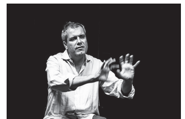
Manuel Aires Mateus in conversation, The University of Auckland, School of Architecture and Planning, 2012.