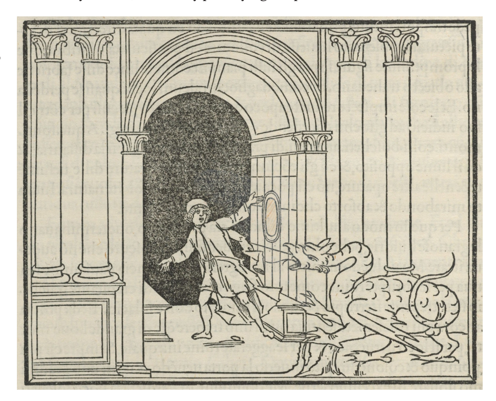
Fig. 1: Hypnerotomachia Poliphili (1499), Poliphilo encounters the Dragon

For instance, the narrative is a macro-structural succession of allegorical sequences that do not depict scenes indicative of a psychological portrait of either the protagonist or other significant characters through dialogue, as for example in Chaucer's Troilus. Conversely, the author is concerned moreover with a metanarrative in which Poliphilo is positioned and must comprehend the metaphorical sequences around him, in order for the narrative to proceed as a reflection of his own advancing interiority from unwise to wise. On this basis, action and formal contextualisation are intimately related, outwardly portraying Poliphilo's inner motions of his soul.<sup>16</sup>